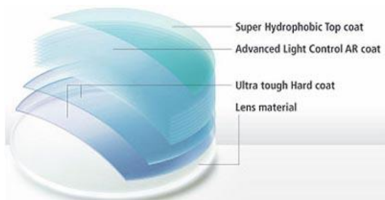
Fig : Thin layer coatings in visor.

As the coating is done by different layer, each layer can restrict the few light ray so as we can get good vision.