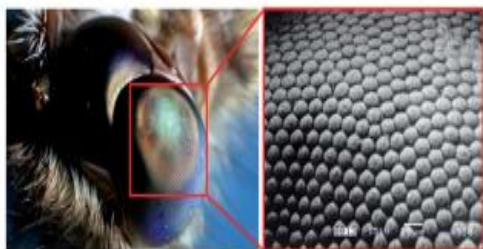
Fig: SEM image of eye lens of moth.

Anti reflecting coating cannot be done as like painting on walls or as like a thick layer to be applied. The ARC coating techniques are derived from natural species such as moth and antelopes. The broad vision field of eyes of eagles also a factor to this methods. The Scanning electron microscopic images of eye field of moth says that they have eye surface as a nano bumps on the upper surface of its corneal lens.